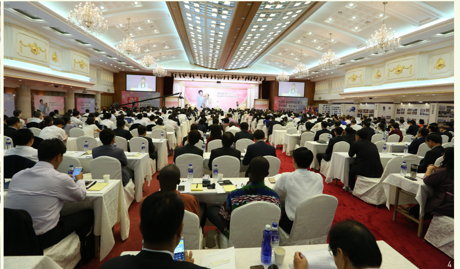
4. A complete view of the 2015 Cheon Il Guk Leaders Special Assembly opening ceremony