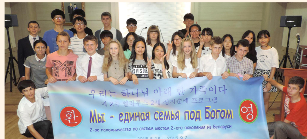
Second-generation members from Belarus and seonghwa students of Gunpo Church taking a commemorative photo after establishing sisterhood and brotherhood ties