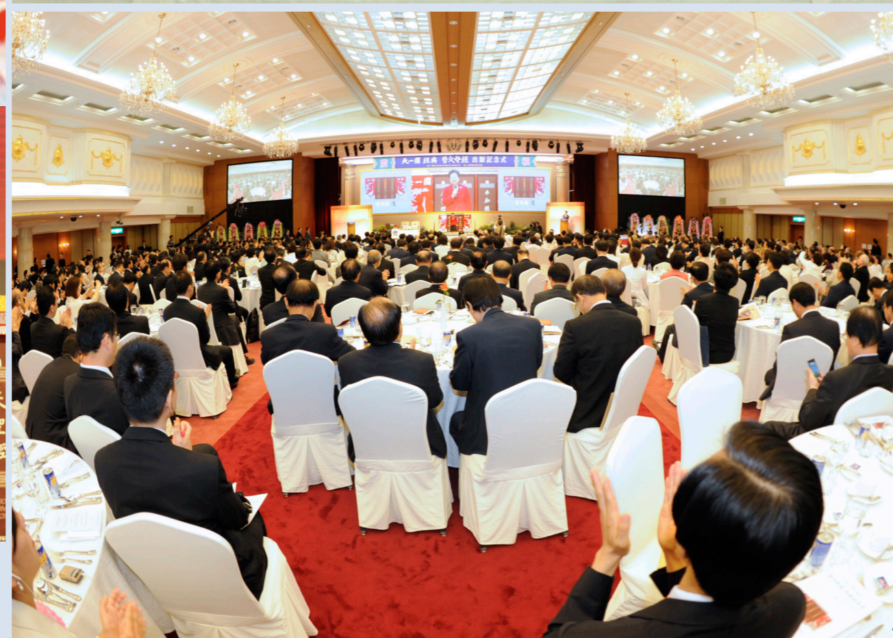
1. True Mother speaking 2. International President Moon Sun-jin and Vice-President Park In-sup dedicating Cham Bumo Gyeong to True Parents 3. All the thirteen regional representatives that received copies of Cham Bumo Gyeong 4. A full view of the Cham Bumo Gyeong publication ceremony

The Cheon Il Guk Scripture Compilation Committee of the Family Federation for World Peace and Reunification (FFWPU) hosted a Chambumo Gyeong Publication Ceremony for Chambumo Gyeong on the 19th day of the 7th month (September 1) at the main hall at the Cheongpyeong Heaven and Earth Training Center, with 900 people in attendance, including True Mother and FFWPU International President Moon Sun-jin with her husband, Park In-seop.