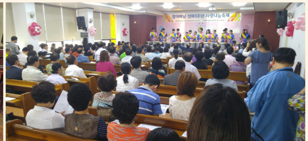
A complete view of the Love and Share Festival at Cheongju Family Church

Meanwhile, a Love Sharing Festival is planned to be held sometime in August or September, anticipating an expected total of over 90,000 participants which will include blessed families, members, ambassadors for peace, new members and local residents. On the Sunday of 7.10 by the heavenly calendar (August 23), this Love Sharing Festival was enjoyed at Chungbuk Region Cheonju Church, Kwangju Region Kwangju Church, East Seoul Region Kwangjin Church, South Gyeonggi Region Pyeongtaek Church and Gunpo Church, and Haeyang Region Haeyang Church.