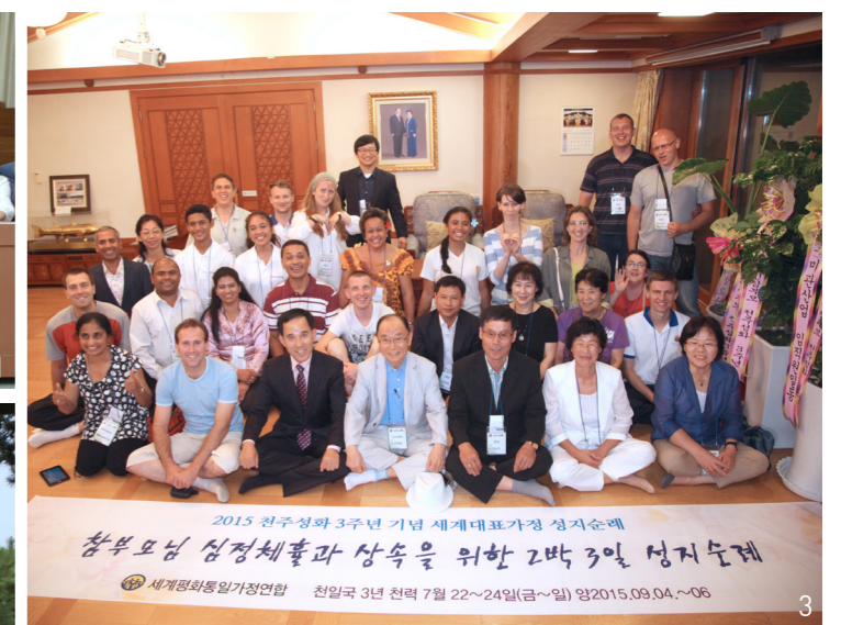
1. Group photo taken after the opening ceremony in Busan Family Church 2. The 1st holy ground pilgrimage team taking a commemorative photo at No 1 holy ground - Beom Net Gol - in Busan 3. The 2nd holy ground pilgrimage team taking a commemorative photo at the Blue Sea Training Center