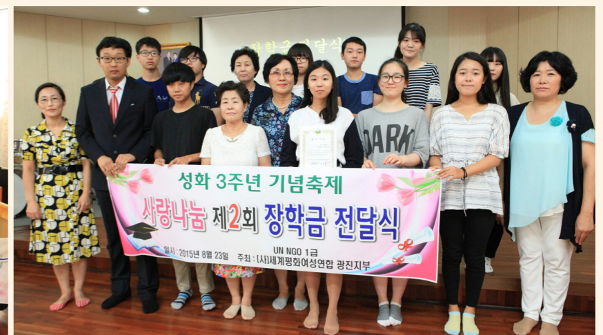
Scholarship presentations by WFWP-Gwanjin branch