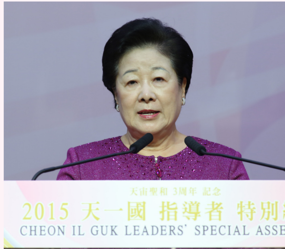
1. True Mother speaking at the launching ceremony 2. Dedicating a plaque of gratitude for victoriously completing the 121-nation Peace Road journey 3. Scene of the Cheon Il Guk Leaders Special Assembly resolution being read 4. Cheon Il Guk leaders convey their determination to fulfill Vision 2020 in front of True Mother