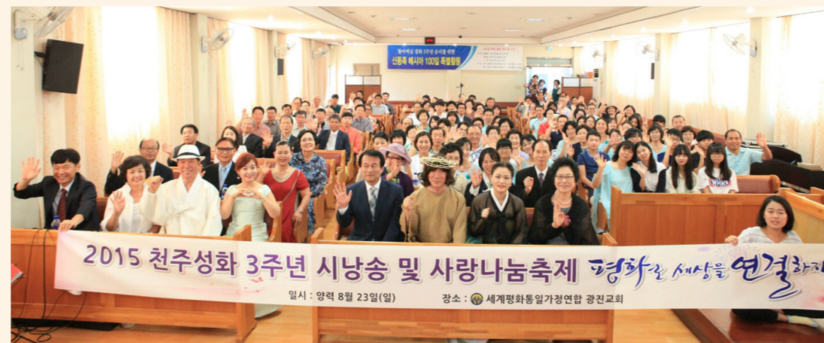
Love and Share Festival at Gwangshi Church of East Seoul District

Additionally, at this joint worship service in which 22 regions from around the nation are to participate, each area will create a joint choir of over 200 people to praise the nobility and glory of True Parents and open the hearts of the blessed families. There will also be a time to inherit True Parents’ shimjeong through the reminiscences of many of the past FFWPU-Korea presidents. They are preparing so this can become a place of harmony in which first and second generation can become one and carry out the dream of the realization of Cheon Il Guk.