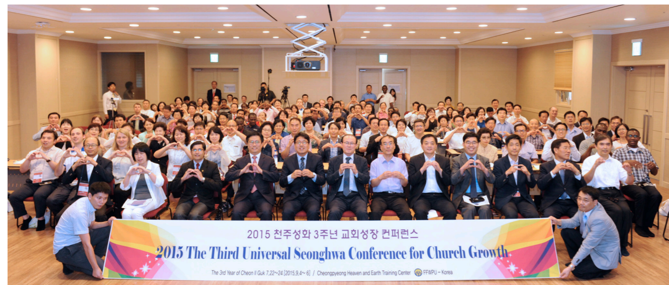
Group photo taken after the opening ceremony of the 2015 Church Growth Conference in Commemoration of the Third Universal Seonghwa Memorial