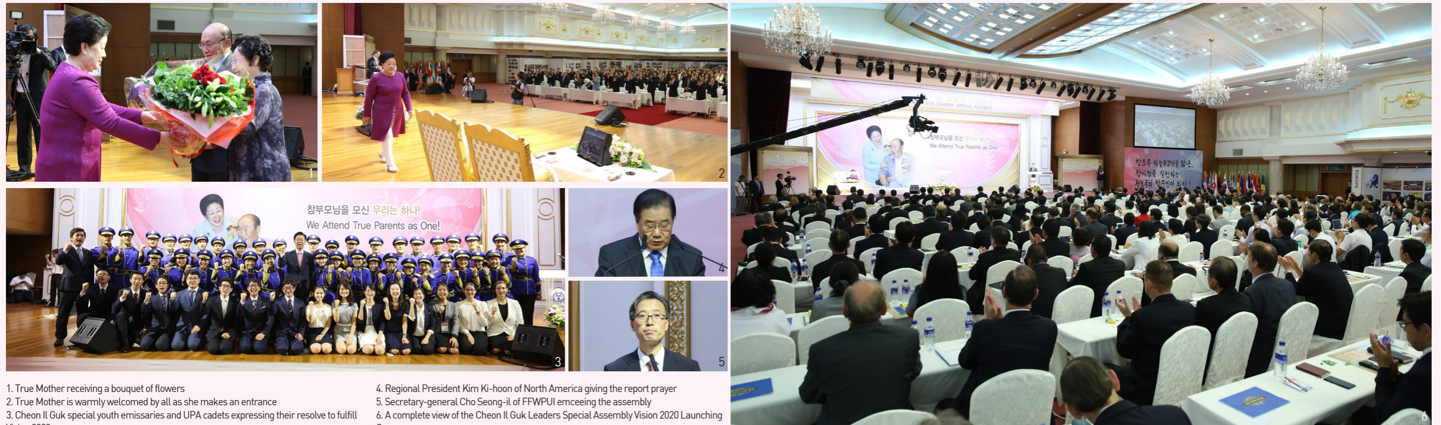
1. True Mother receiving a bouquet of flowers

Resolved, we leaders of Cheon Il Guk will not participate or agree with any unprincipled actions that damage the status or value of the True Parents of Heaven, Earth and Humankind, will obey the Cheon Il Guk scriptures and the Cheon Il Guk constitution, and will move forward. 🙏