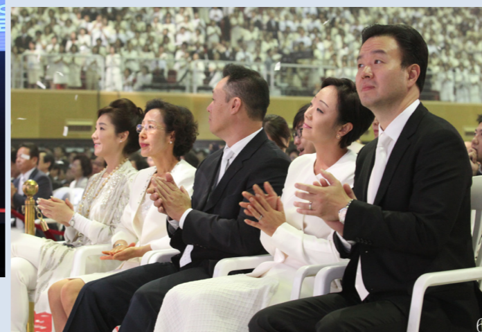
1-4. A scene from the commemorative musical – A Person Who Loved Japan More than Anyone Else 5. Leaders from across the world enjoying the commemorative musical