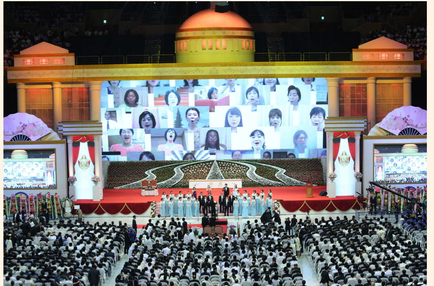
1. True Mother leading the Third Universal Seonghwa Memorial 2. True Mother makes a floral tribute to True Father