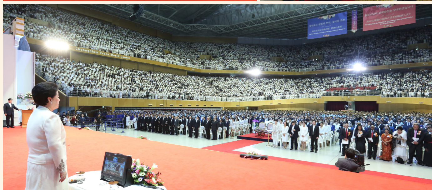
1. True Mother leading the Third Universal Seonghwa Memorial 2. True Mother makes a floral tribute to True Father 3. Children and grandchildren of the True Family make floral tributes