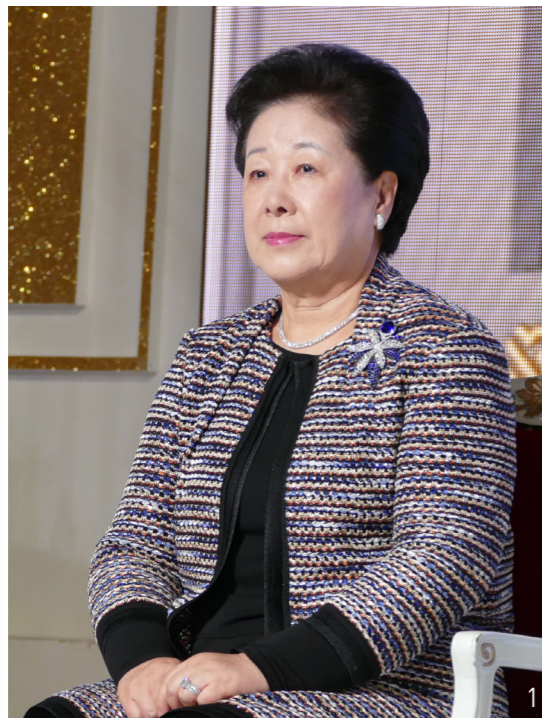
1. True Mother at the First Sunhak Peace Prize Award Ceremony