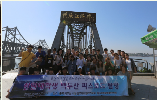
Photos taken at the Yalu River railroad bridge by CARP exploring team of Mt. Baekdu