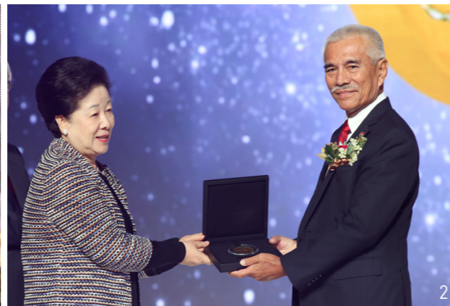
2. True Mother presents the Sunhak Peace Prize to President Anote Tong of Kiribati, a co-winner of the Sunhak Peace Prize