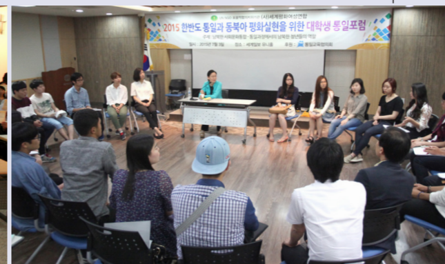
A scene of the unification forum held for university students