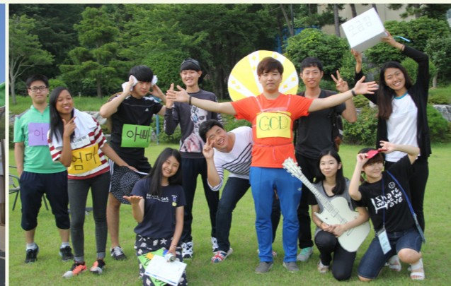
Workshop participants taking part in team projects