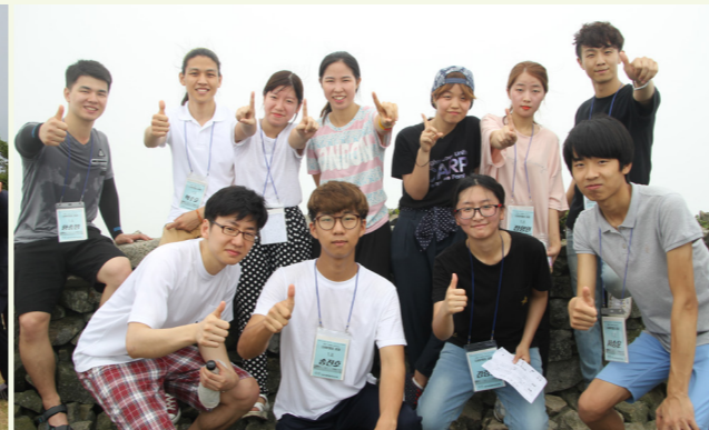
Workshop participants at to the holy ground on Mt. Bonghwa

The Collegiate Association for the Research of Principle in Korea (hereafter CARP Korea) held various events on the occasion of the third anniversary of the Universal Seonghwa of Rev. Sun Myung Moon, the True Parents of Heaven, Earth and Humankind. These events included the "2015 Special Summer Workshop" (hereafter Special Workshop), CARP's Journey for Hope, College Students' Visit to Mt. Baekdu and the First Competition for Church Songs. Among the events held by CARP to inherit True Parents' tradition and pioneer the future of the movement were the "2015 National Seonghwa Camp" and the "World Assembly for Youths and Students."