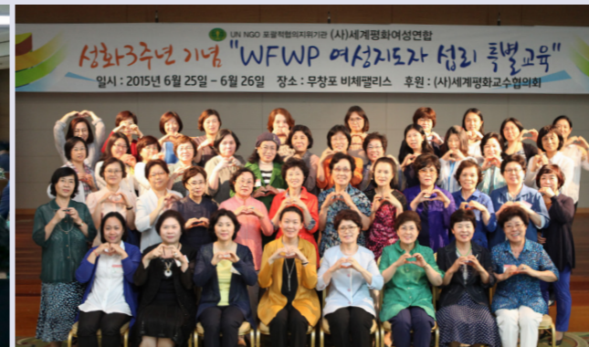
WFWP leaders taking commemorative photos after receiving special education on the providence