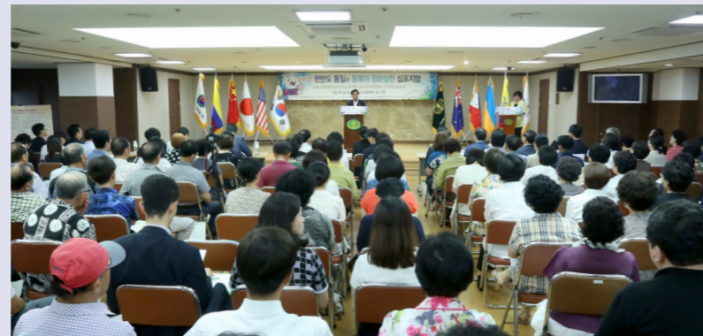
A panorama of the 2015 Symposium for the Unification of the Korean Peninsula and for the Realization of Peace in Northeast Asia