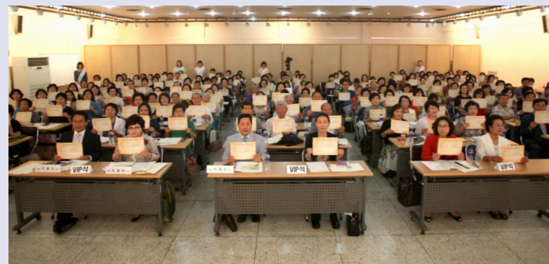
Group photos taken after everyone signed the petition