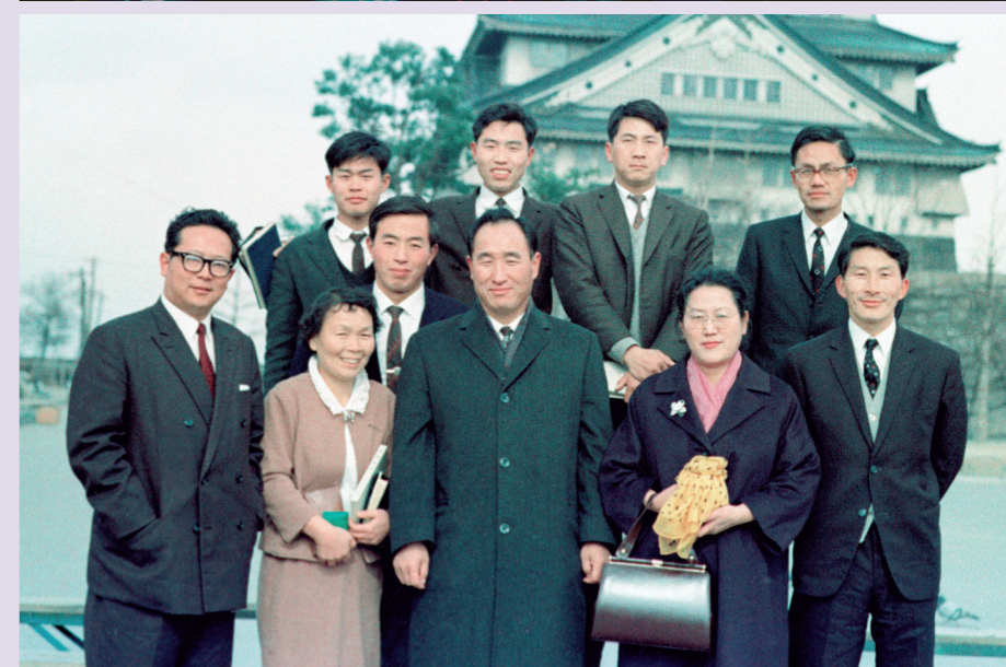
1. Day of Hope banquet held in Tokyo on February 1972 2. True Father speaking at a members' rally held in Saitama 3. 1965 - After choosing a holy ground, True Father took this commemorative photo with Japanese leaders that were with him