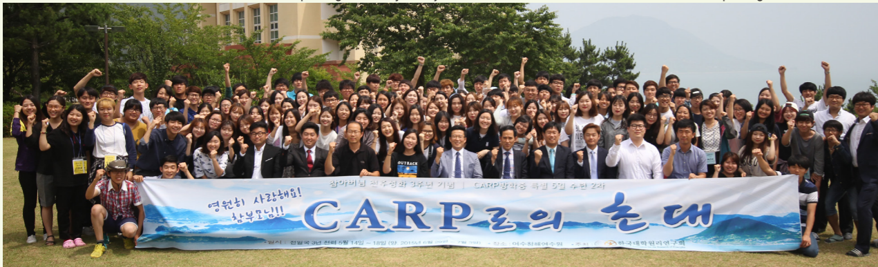
Participants making resolutions to successfully hold the Third Universal Seonghwa Memorial during their 2nd summer vacation workshop held by CARP-Korea