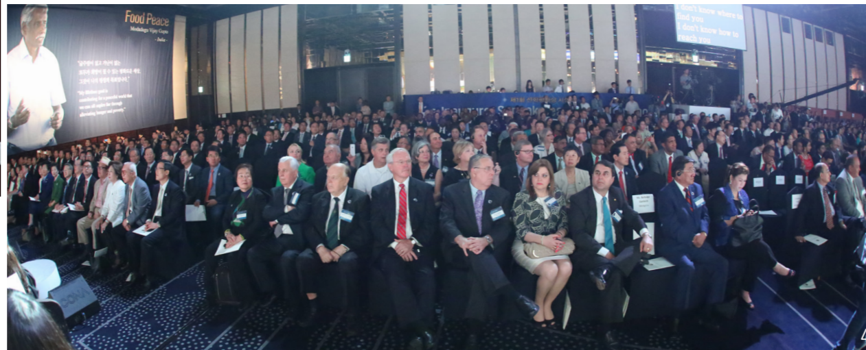
4. Prominent guests from Korea and abroad participating at the First Sunhak Peace Prize Award Ceremony