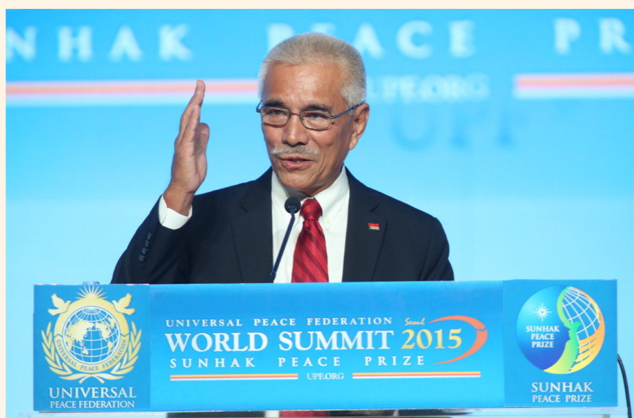
Co-winner President Anote Tong

For the sake of our descendents, we need to do more than be aware. We need to take action and find a comprehensive solution that provides peace and security without causing harm to anybody. We need to take action that secures the future of our planet and our worldwide community, and we need to take action that does not disregard any of our people. More than anything else, we must seek urgent action for the sake of the weakest people in the countries on