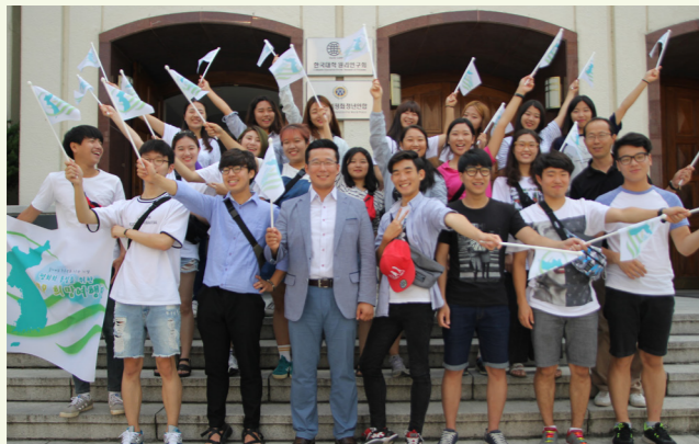
CARP Hope Travel Group takes commemorative photos in front of the CARP center before departing for their journey