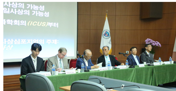
A complete view of the debate at the first break-out session

The professors who had given presentations and led discussion also commented that they had been very moved while reading Rev. Moon's autobiography and assembled sermons while preparing for this presentation, and that they had come to understand more deeply his work for peace. <Report provided by: Sun Moon University Sun Myung Moon Institute>