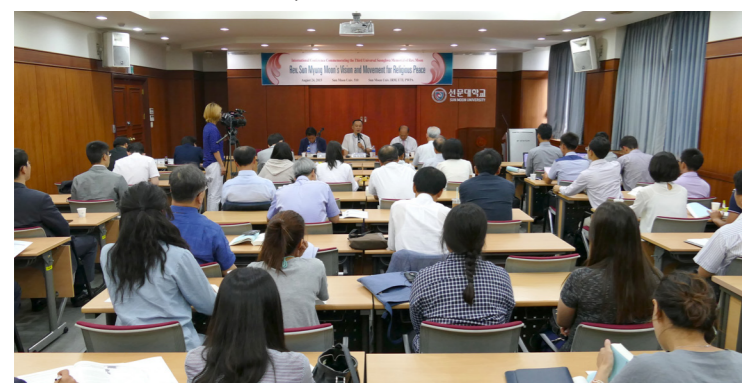
A complete view of the debate at the sixth break-out session