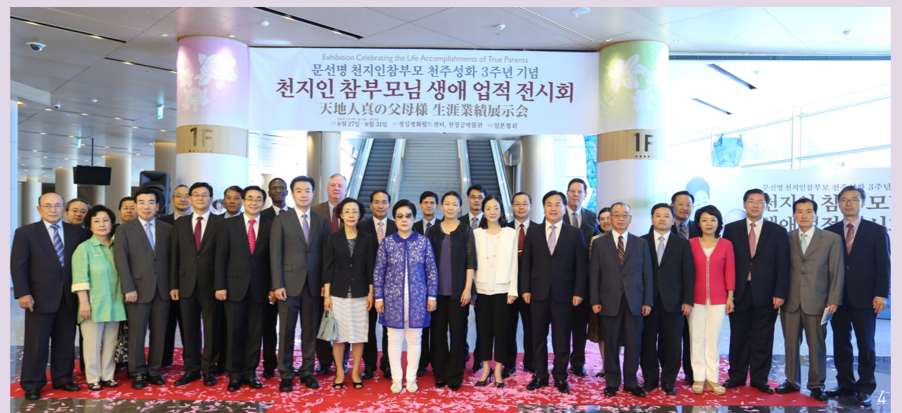
1. True Mother looking around at the Exhibition on True Parents’ Life Courses in Cheongshim Peace World Center 2-3. True Mother looking around in the exhibition hall of Cheon