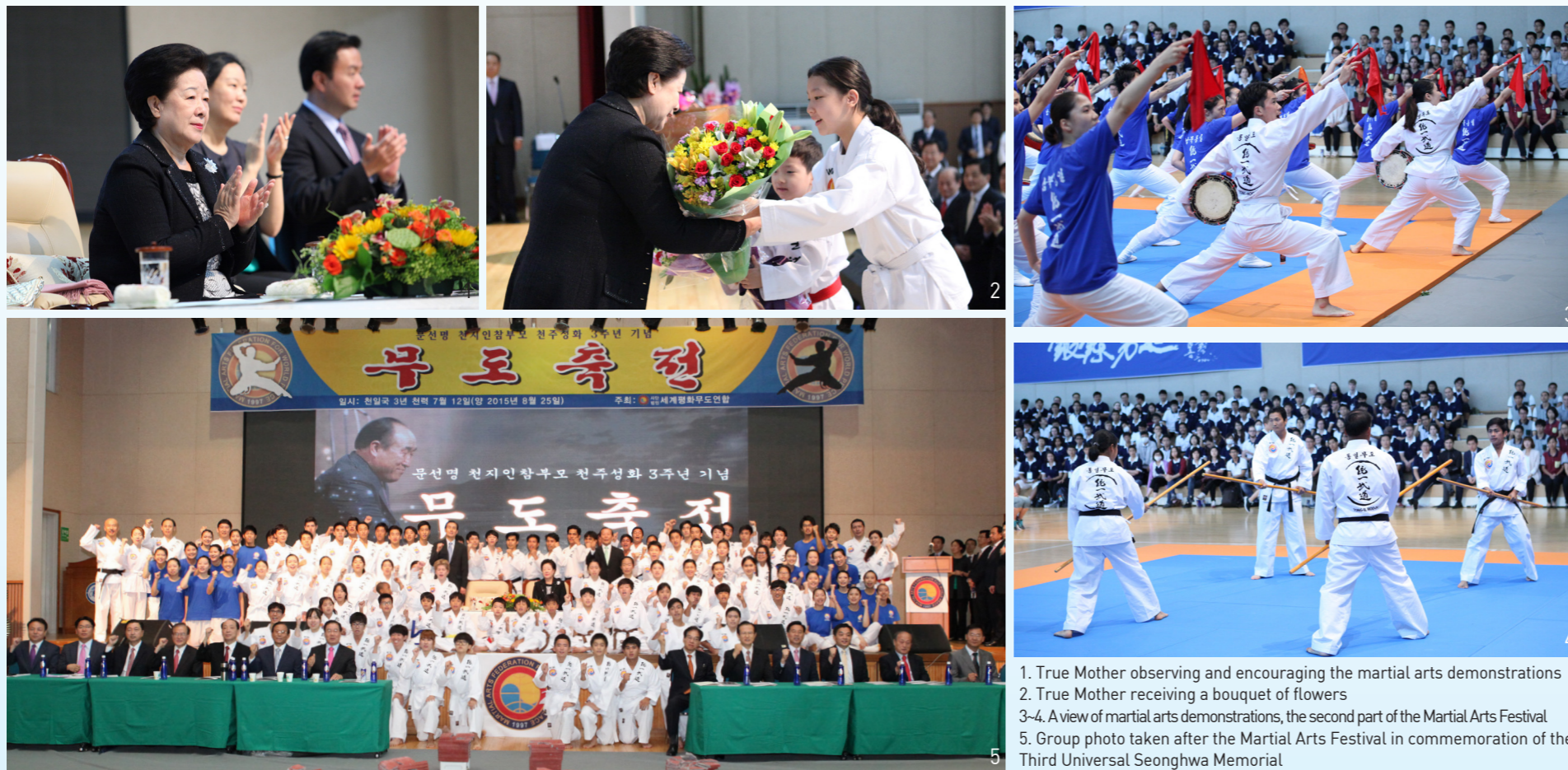
1. True Mother observing and encouraging the martial arts demonstrations 2. True Mother receiving a bouquet of flowers 3-4. A view of martial arts demonstrations, the second part of the Martial Arts Festival 5. Group photo taken after the Martial Arts Festival in commemoration of the Third Universal Seonghwa Memorial

Martial Arts Federation has expanded to forty nations ever since its establishment and is continuing the founder's spirit of Love God, Love all People and Love your Country.