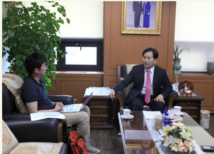
An interviewing reporter from Munhwa Times

Religion reporters from nine major dailies participated, Press Center, Seoul