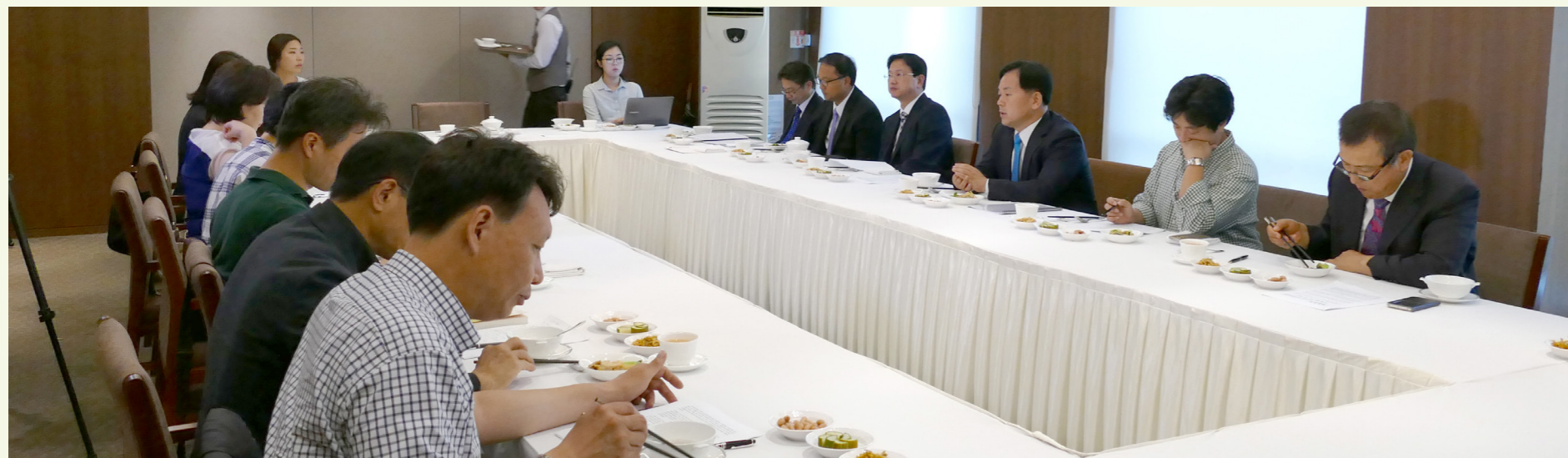
A complete view of the Religion Reporters Meeting in Commemoration of the Third Universal Seonghwa Memorial

In commemoration of the Third Universal Seonghwa Memorial of Sun Myung Moon, the True Parent of Heaven, Earth and Humankind, a meeting of religion reporters was held on 7.12 by the heavenly calendar (Aug 25) at the Press Center, Seoul. The reporters are in charge of the religion section in nine major newspapers including Joseon Times, JoongAng Times, Donga Times, Segye Times and others.