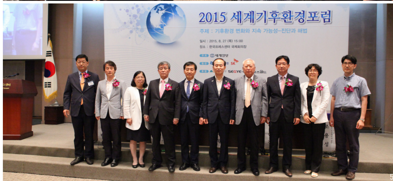
1. Cha Jun-yeong, president of Segye Times, giving the opening address 2. Yang Su-gil, former chairman of Green Growth Committee, giving the keynote address 3. Minister of Environment Yun Seong-gyu giving a congratulatory address